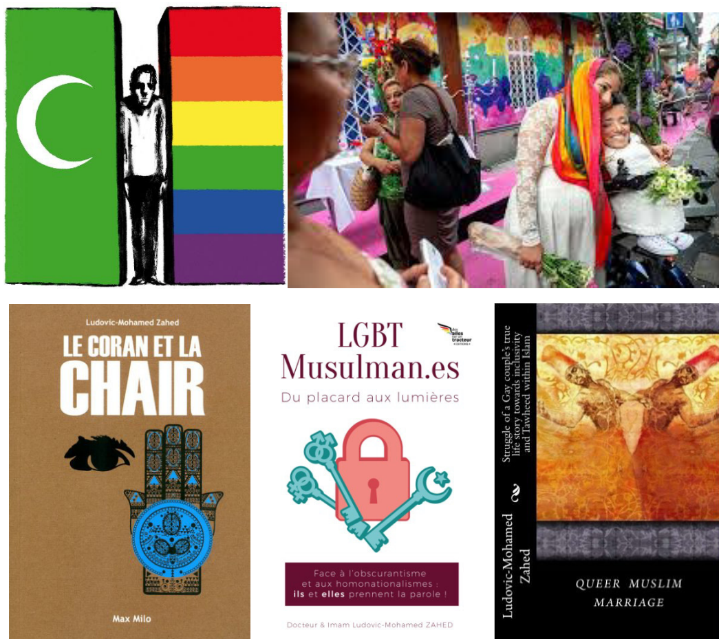
*A complete list of our publications is available online .